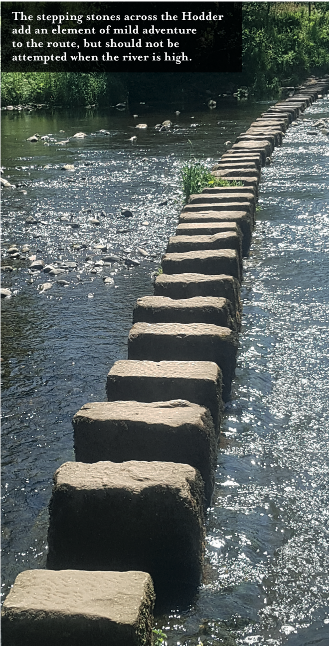
The stepping stones across the Hodder add an element of mild adventure to the route, but should not be attempted when the river is high.